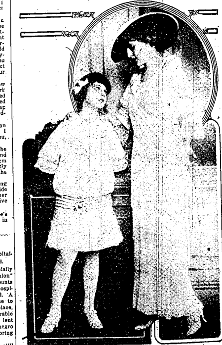
Left: Child's dress of fancy net trimmed with tiny buds. Right: White chiffon dress with milk corsage; three blue tunic of lace with white spots; white silk sash.