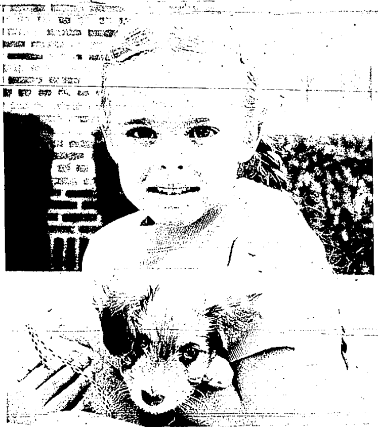
SIMPLE but eye-catching photographs are possible at the annual Fall Festival pet show (at 9 a.m., Saturday morning, Sept. 8) held in front of the band shell near the park. Concentrate on closeups keeping the child and pet close to each other if possible; seek a simple background.