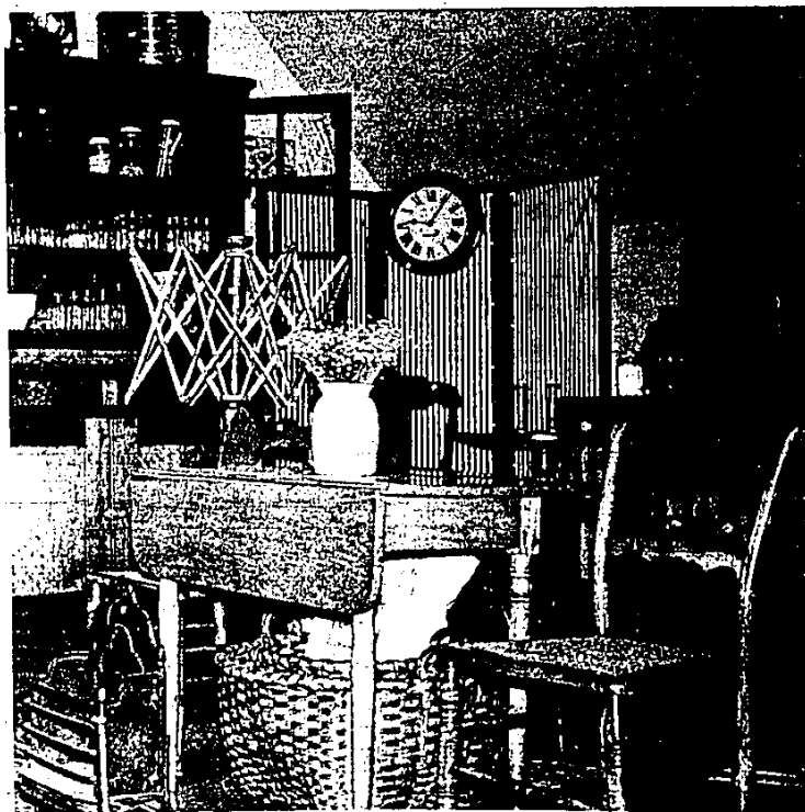
TWENTY-THREE DEALERS will display their wares at the Plymouth Symphony League's Antique Mart. No reproductions are allowed in the three-day sale which has attracted dealers from as far away as Pennsylvania.