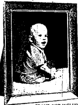
FRAME NOT INCLUDED