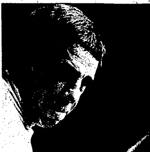
BUDDY RICH and his orchestra prepare for a performance for the Clarenceville Entertainment Series Sept. 29 and 30 in L.E. Schmidt Auditorium, 20155 Middle Belt Rd., Livonia.

The first performance is scheduled for Oct. 14, at 4 p.m. in the Rackham Auditorium.