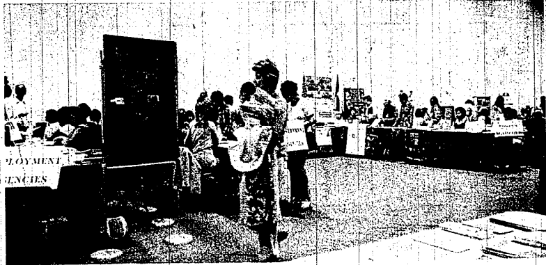
WOMEN ATTENDING could find plenty of opportune ideas among the rows of employment, education, volunteer and club representatives.