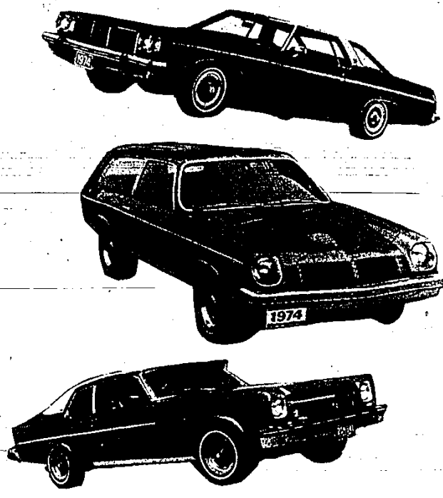
DETROIT'S IN THE NEWS as the new models finish up their '74 debuts.

We reserve the right to limit quantities. All items subject to prior sale.