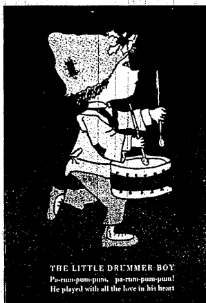
THE LITTLE DREAMER BOY Pa-rum-pum-pum, pa-rum-pum-pum! He played with all the love in his heart

MICHIGAN'S CHAPTER of Sudden Infant Death, Inc. will raise money for the national foundation through the sale of this card, offered for $3.50 per box (25 cards) or $4.25 per box with name imprint. Check or money order is to be mailed to Michigan Chapter, National Foundation for Sudden Infant Death, Inc., P.O. Box 2223, Livonia, 48151.