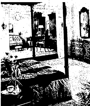
OFF-BEAT COLOR SCHEME is the idea behind Designer Robert Whitman's bedroom, with vibrant shades of color found in the most beautiful flower gardens. It combines the colors your mother told you wouldn't work ... and makes them work beautifully.

Eclectic is a fascinating idea ... but every time YOU try it, it seems to turn out "hodge-podge." Taking what appears to be the best of various styles or colors is an art -- and the whole business of going eclectic is one of the most exciting adventures in home decorating today.