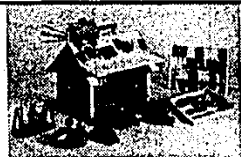
(A) FAMILY SCHOOL

Christmas is just around the corner.... Stock up now at these savings!