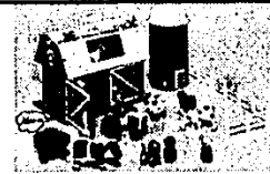
(B) FAMILY FARM