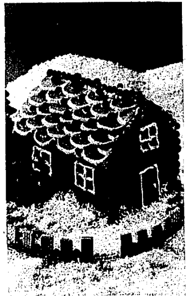
PREFAB GINGERBREAD house made with mixes!

Make a fence with halved wafers and cranberries pressed into a ring of frosting. Inverted cones covered with green-tinted frosting studded with cranberries become trees.