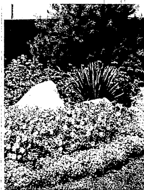
THIS SIMPLE, but colorful corner garden is easy to create. A redwood fence, a bushy evergreen, two boulders with a yucca plant between, and a mass of colorful flowering annuals are all it requires.

In front of the pine is a large bed of giant cactus-flowered zinnias. In this case they are all one color (bright red), but a mixture of colors would be suitable. In the center of the flower bed is a group of boulders and a yucca plant to provide a natural break among the plantings.