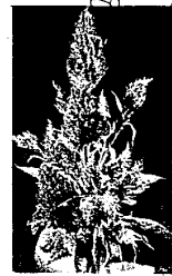
CELOSIA Red Fox, all-America bronze medal winner for 1974, makes a beautiful flower arrangement.

Once you have tried this glorious new annual flower you may never want to be without it in your garden.