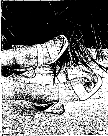
Sleek, rhinestone-studded and only $100.