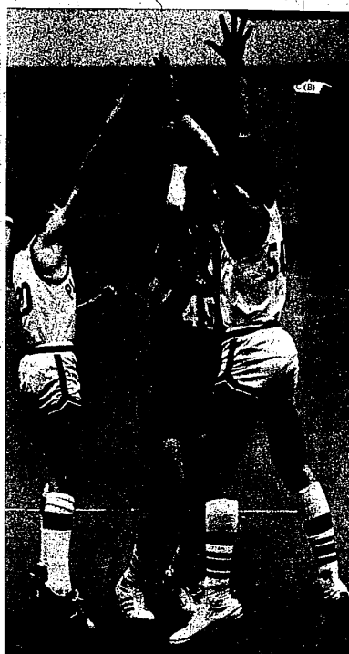
Plymouth Salem was all over Farmington Tuesday night

Plymouth... 18 10 19 20-67 Harrison... 9 18 4 13-44