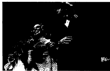
MARCHING DOWN THE AISLE

be the accompaniment for a brisk exit by the wedding party.