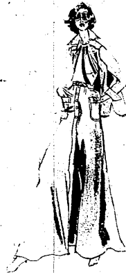
Ticking in solid color for day or night, Di Sant' Angelo provides a casual, but sophisticated look