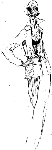
The suit for day, comfortable, dressed up or down, Di Sant' Angelo designs the go anywhere look

The di Sant' Angelo thinking is in tune with women . . . and this year he thinks women want to play in something other than faded blue.