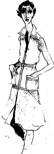
Giorgio Di Sant' Angelo designs a patchwork skirt with different colors of mattress ticking