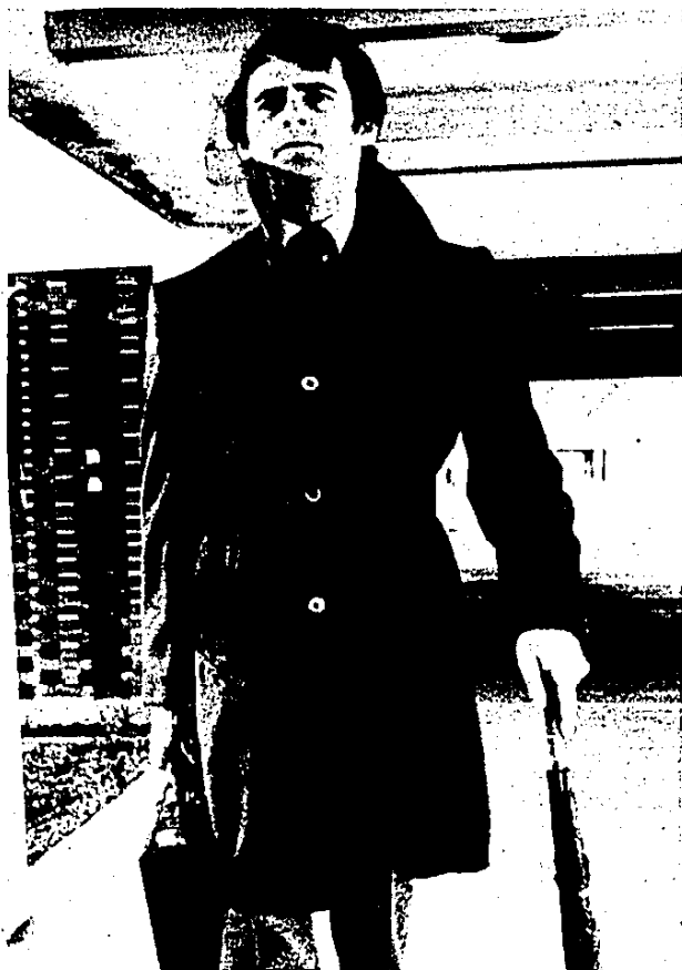
The Qiana silk-like all-weather coat

Fly front coats also make a debut this spring. Sporting raglan sleeves, slightly flared body styles and sleeve buckles, the fly front coat is easy and uncomplicated.