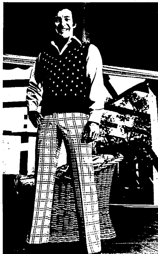
The natural tones of linen and cotton combine for the summer sweater by Egon Von Furstenberg.

In the 1974 version of "The Great Gatsby," sweaters play an important role in the leisurely life of Long Island summer people. Their styles—'30s nostalgia, are the spring look for men.