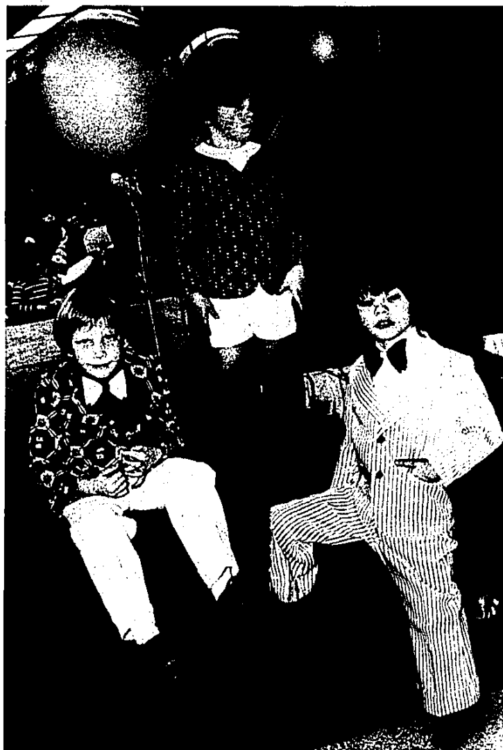
Nautical themes and pinstripes answer the question "Little Man, What Now?"

• Extended Payment Plan • BankAmericard • Master Charge MICHIGAN'S FINEST JEWELERS SINCE 1861