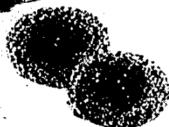
14-Kt. Sapphire Cuff Links $175