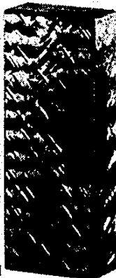
Gold Dunhill Butane Lighter $2.50