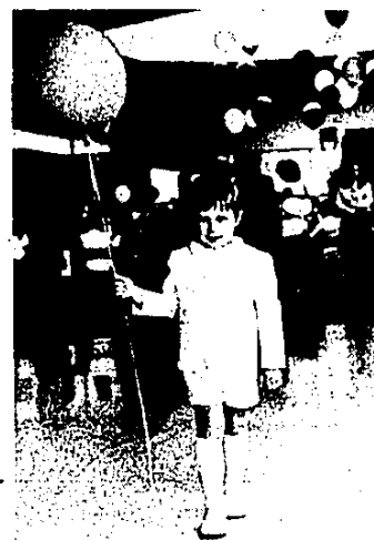
The Gatsby look for the little guy

Denim continues to be a wardrobe necessity, appearing in pants,