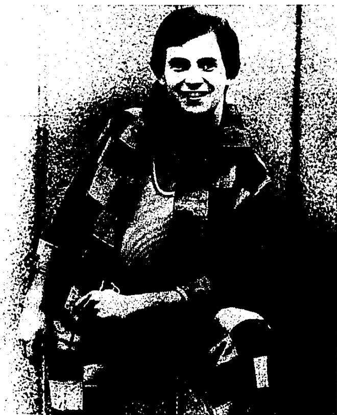
Patchwork denim, raveled