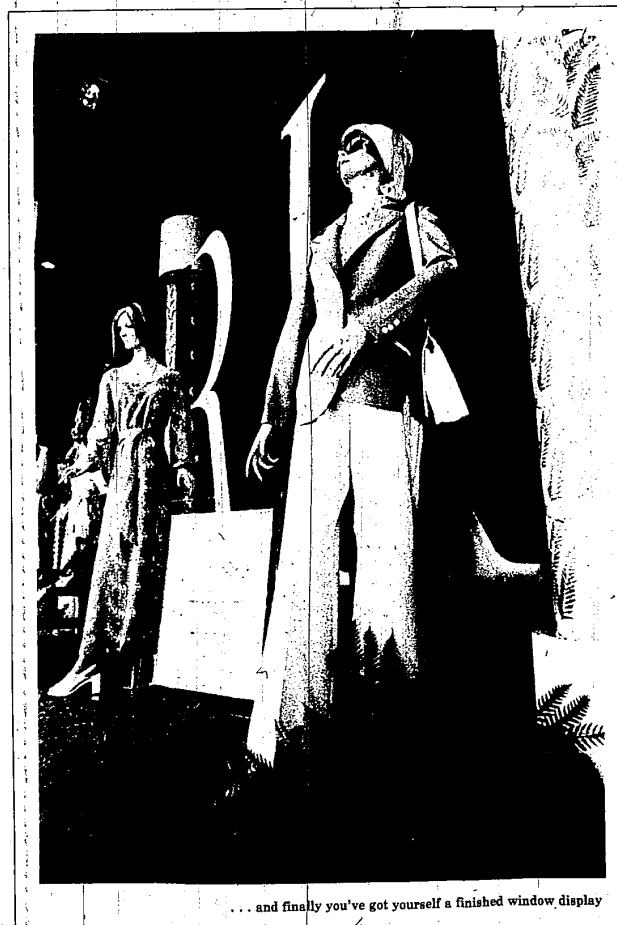
... and finally you've got yourself a finished window display