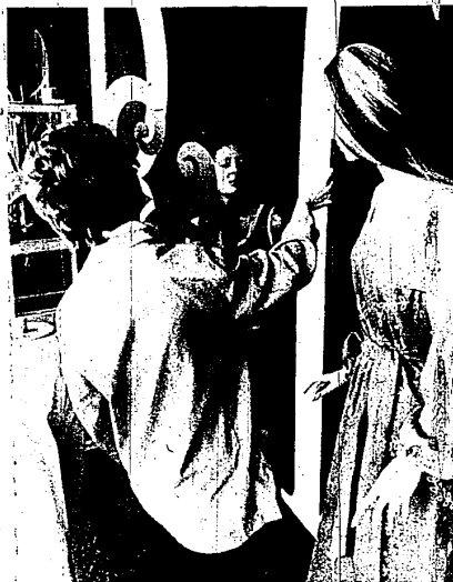
... add some human know-how . . .

"We get a lot of chances to experiment. There's always another window scheduled to be redone," she added.