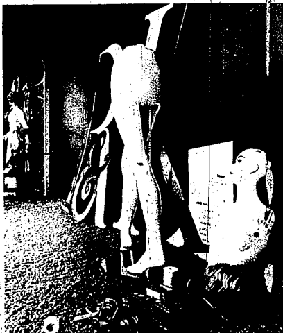
... then you add some props . . .