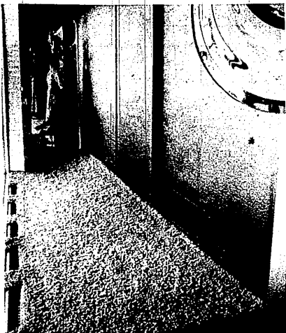
You start with an empty display window . . .