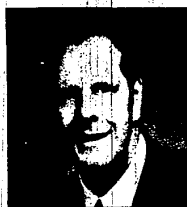
Vice President in charge of NBD's branch offices in the area.