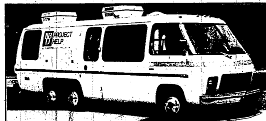
NATIONAL BANK OF DETROIT Member FDIC

You also can have your valuables marked and registered through your local police officials who, in cooperation with other law enforcement agencies, are participating in the nation-wide program, "Operation Identification."