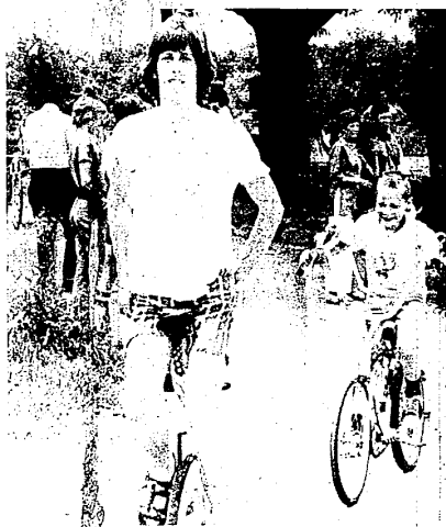
The event drew many spectators on all sorts of non-motorized vehicles.