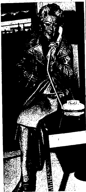
The leather coat is timeless in style and material