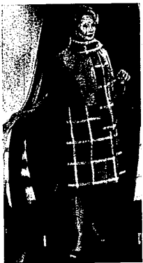
Cashin's winter wrap-up features grey suede with matching wool check

A simple, understated and classic motif inspires every Bonnie Cashin collection. But every season that theme gets a new twist.