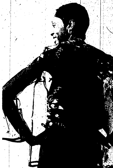
See-through overjackets are important for fall evenings.