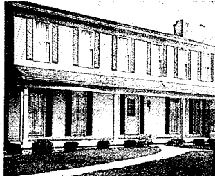
WOOD RETAINS its popularity as a building material because it is easily worked and a good insulator. Though covered by this striking facade, studs placed at 24-inch intervals make it easy to install energy-saving insulation batts between the framing members.

Motorists are urged to watch for slow moving farm vehicles on the highways while farmers are being asked to use caution when entering roadways.