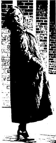
Halston's look of the big coat translated into fur.

The informal mood was achieved through turned-back cuffs, open neckline and unbuttoned center front styling.