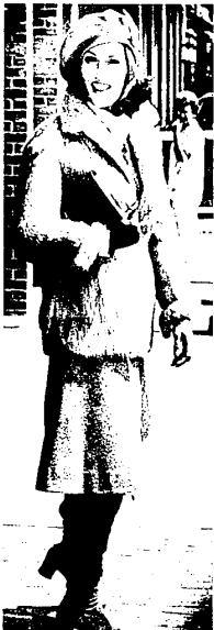
Golden amber jacket is a natural compliment to fall's booted skirt look.