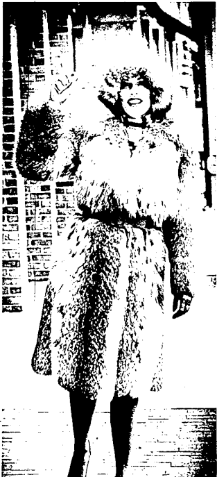
Collared coat reflects fall's styling characteristics.