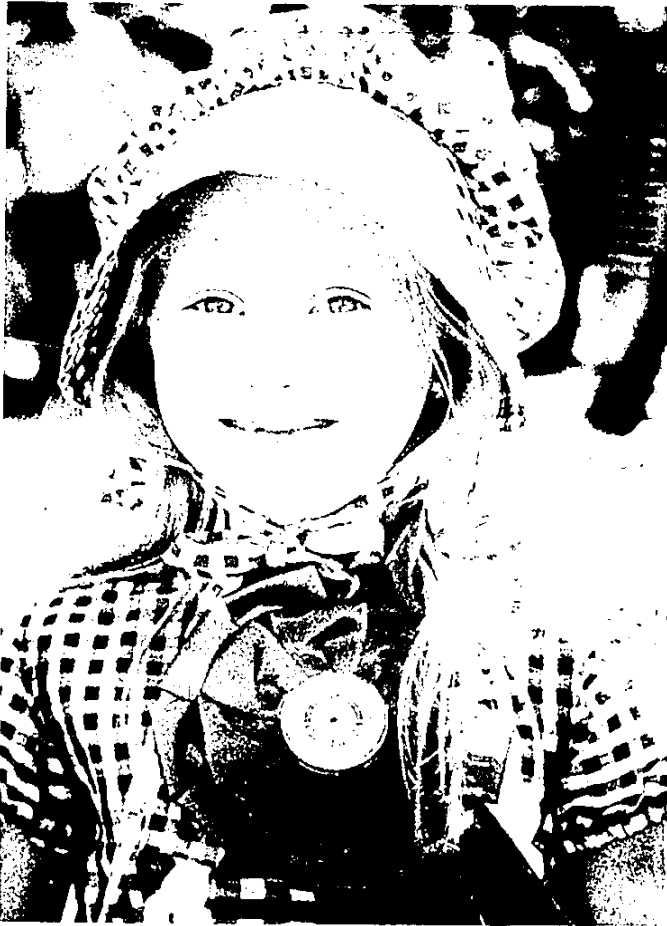
SUNBONNETS and toothless smiles from pretty little girls are in abundance at the Fall Festival's Costume Competition, sponsored by the AAUW. This year's contest will be Sunday, Sept. 8, from 1:30 to 2:30 p.m. behind the bandstand in Kellogg Park. Winners will be announced at 3 p.m.