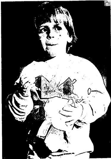
Snoopy in night shirt and cap