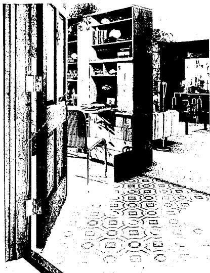
GOOD FIRST IMPRESSION begins in the foyer. The European ceramic tile-patterned no-wax floor in the foyer is contrasted by the living room's thick solid color carpeting.

The old saw "first impressions count" goes for houses as well as people. So, when you redecorate your home, put your best foot forward in the place people see first, the foyer.