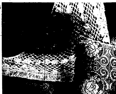
Hand crocheted shawls and fancy stuffed pillows will be on sale at the Senior Citizens Friendship Club of Troy Annual Bazaar.

A snack bar will be open all day. A magician and cartoons will entertain children, and nursery and toddler care will be provided.