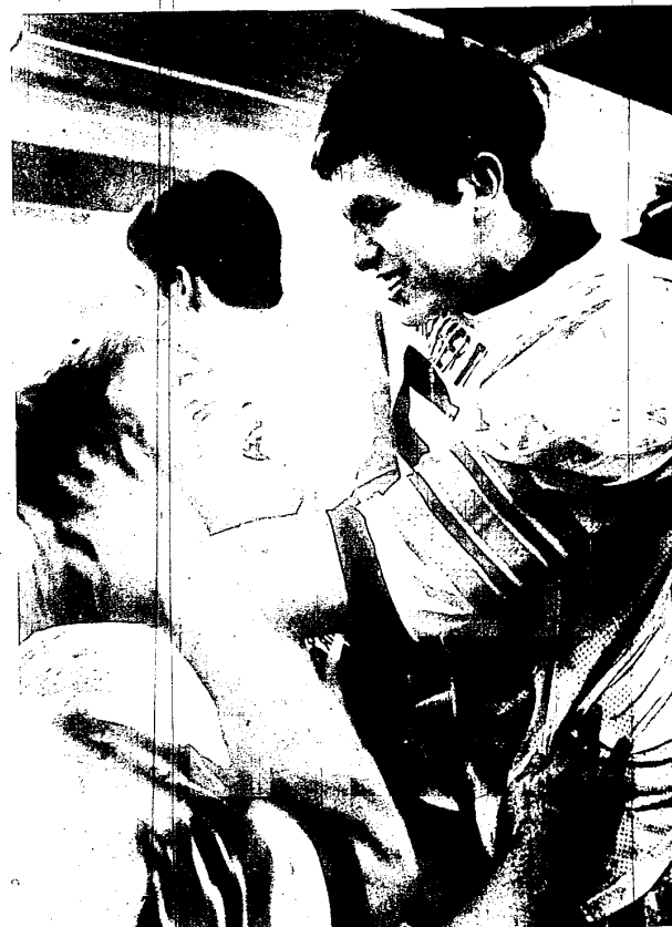
To the victors go the spoils. Two Rice players enjoy the fruits of victory.