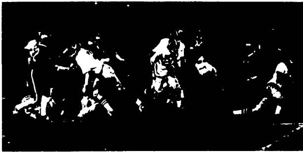
Bert Herzog takes off on an 80-yard gallop for Farmington High's first touchdown in the 38-0 triumph over Waterford which brought